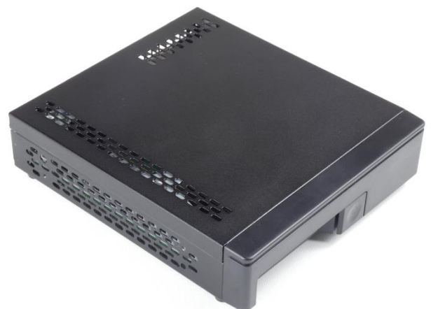
(Chassis with rubber feet installed, horizontal operating mode)