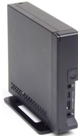
(Chassis with desk stand installed, vertical operating mode)

S26361-F5000-B2 (10 x chassis kit incl. 10 x heatsink)